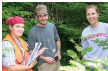
Capstone students receive quality educational experiences.