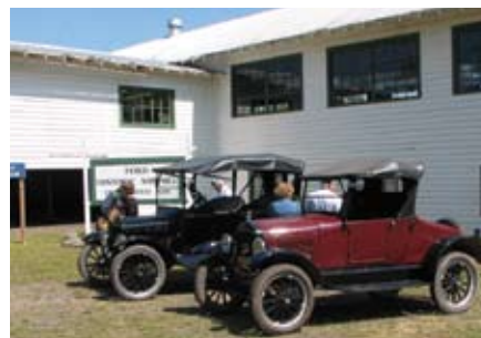
Old model Fords at Tin Lizzie Days.