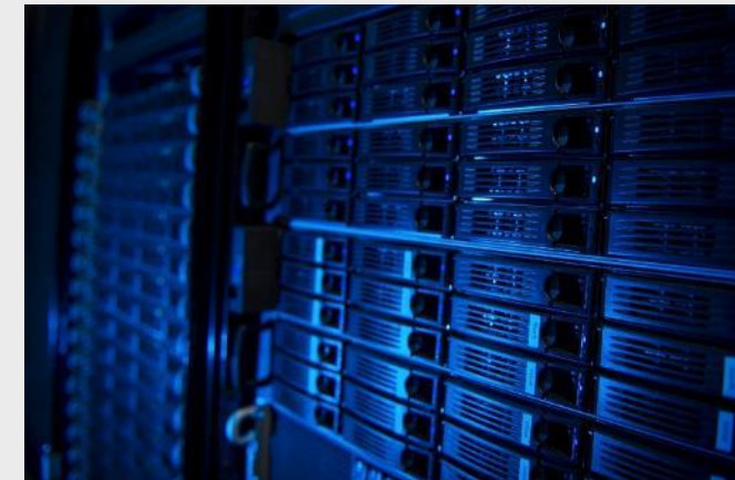
SUPERIOR high-performance computing cluster