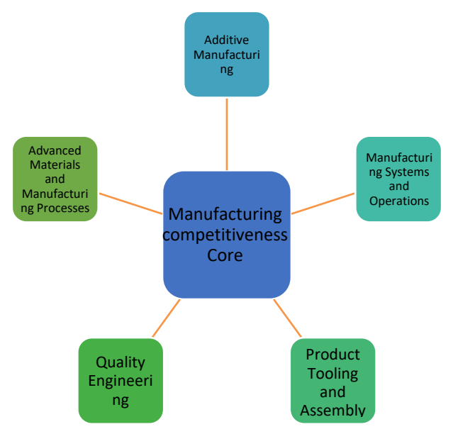
Figure 1. MS & PhD core and emphasis areas

Courses will allow for specialization in Industry 4.0 topics like additive manufacturing, Manufacturing Systems and Operations, Product Tooling and Assembly Engineering, Quality Engineering, and Advanced Materials and Manufacturing Processes. The Manufacturing Engineering PhD program will emphasize research of the most viable and efficient processes used during fabrication, shaping, machining, and assembly (see Figure 1).