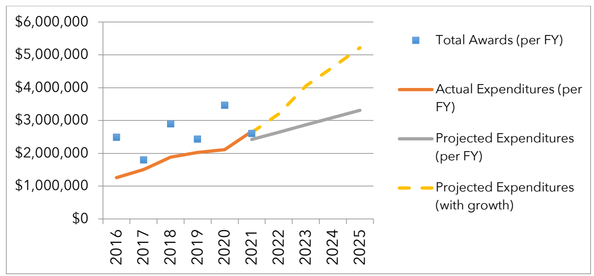
Figure 1. Actual ICC expenditures and new awards from FY16-21, plus modeled expenditures growth FY21-FY25.