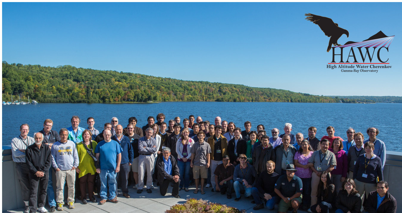
HAWC Meeting 2013

Non-Profit Organization U.S. POSTAGE PAID Permit No. 11 Houghton, Michigan 49931