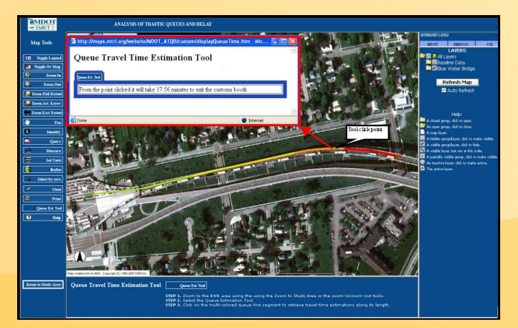
Figure 2: Example of a traffic queue analysis being shared through a decision support mapping portal.

sensing imagery, as well as geographic information system (GIS) based dynamic decision support systems (DDSS) assimilate remote sensing data and ground observations with models. The fusion of high-resolution imagery with in situ (on the ground) observations, coupled with transportation models, produced a useful set of analytical visualization tools for this project.