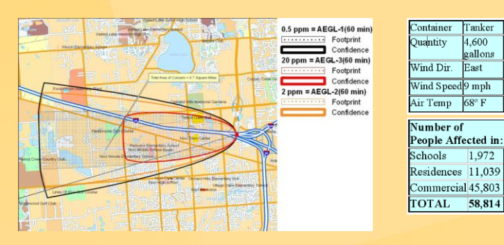
Figure 3: Demonstration of an integrated toolset that analyses the impact of a highway-based chlorine spill on the surrounding local area. The TARUT Study analysis made possible calculations of number of people and businesses affected in addition to the traffic volumes and amount of roads impacted by the plume.