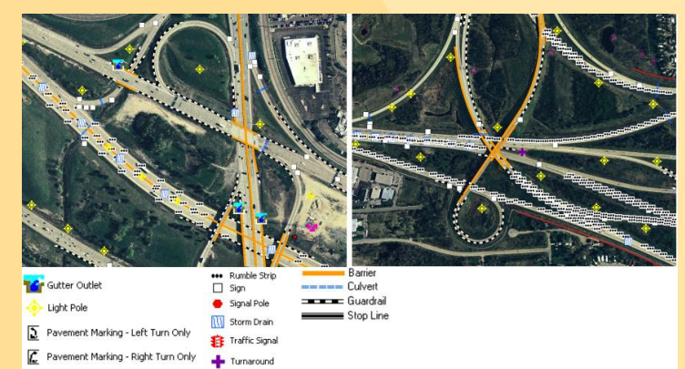
Figure 1: Examples of "road furniture" asset management data collected by application of high-resolution imagery; the analysis and data collection process is now captured in a user-friendly desktop GIS tool developed under the TARUT study.

Many of these data sources have come from non-restricted sources to expedite progress on the study and to allow for comparison between commercial and products and products derived from restricted use technology.