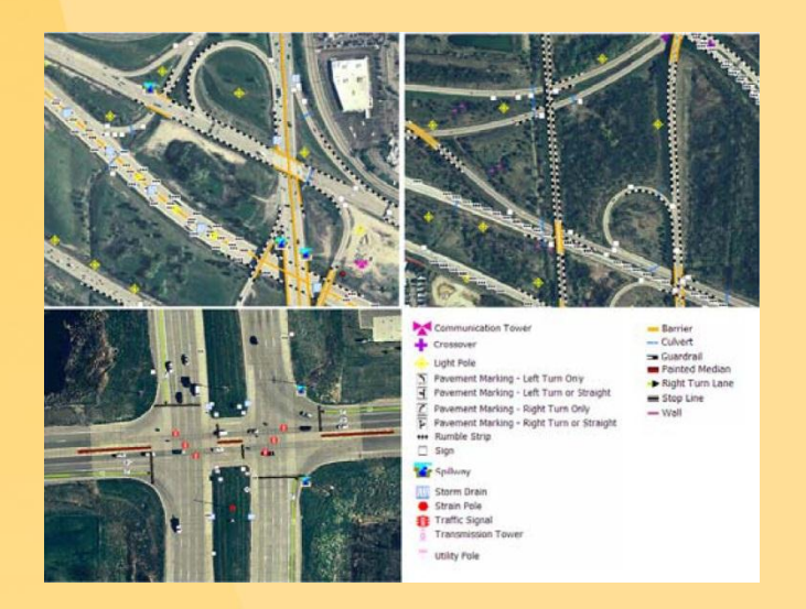
Figure 1: An example of an intensive road furniture inventory collected using the imagery-based methods captured in the Road Furniture Desktop GIS Tool.

MTRI has developed a desktop GIS tool to enable transportation agency users to easily apply high-resolution imagery to creating "road furniture" asset management databases. This "Road Furniture Desktop GIS Tool" operates in an ArcGIS environment and provides a logical workflow to accessing and interpreting imagery to finding road asset features. The tool has been tested and validated in helping to find and inventory over 40 types of road asset features, including guardrails, signs, billboards, rumble strips, light poles, pavement markings, gores, traffic signals, and many others.