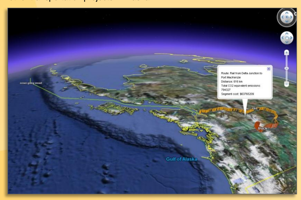
Google Earth visualization of a freight route calculated by MTRI's MOREV tool with route color and height representing carbon emissions for a particular leg as calculated by TCAM.

MTRI has developed multimodal carbon modeling tools for several of its current research projects. In cooperation with the University of Alaska – Fairbanks (UAF), one of these projects involves modeling commodity revenue and cost of mine operations for the proposed Alaska-Canada Rail Link (ACRL) and other transportation projects in Alaska.