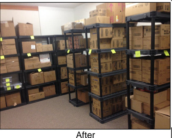
31 Backpacks Supply Room