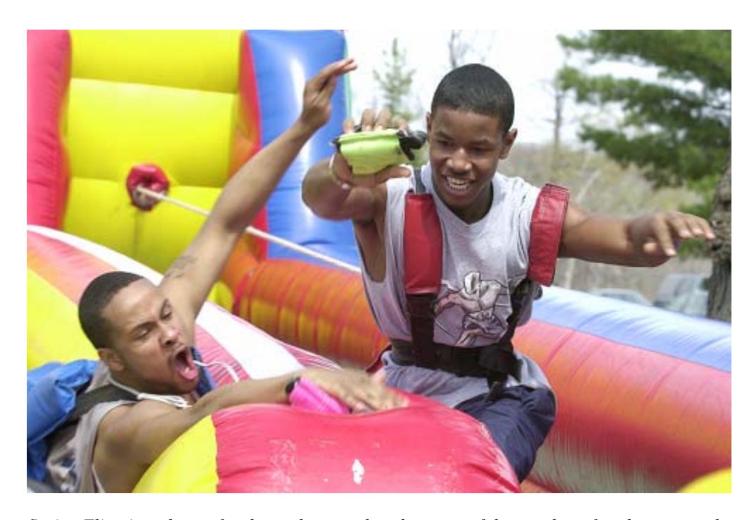
Spring Fling is a chance for the student to take advantage of the weather after the snow melts