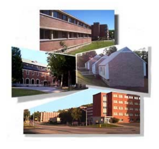
Student resident halls and apartments