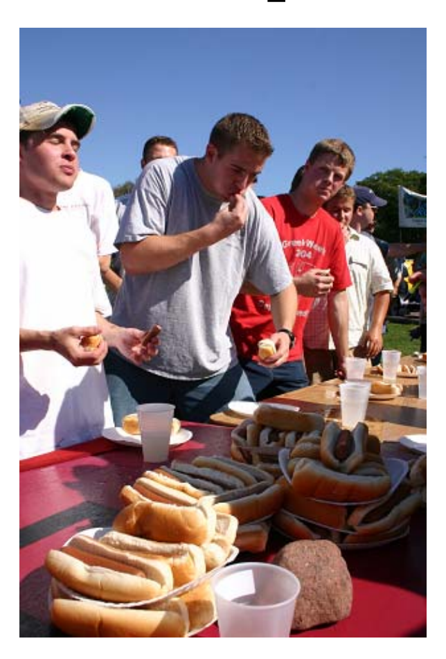
K-Day is an annual MTU Tradition