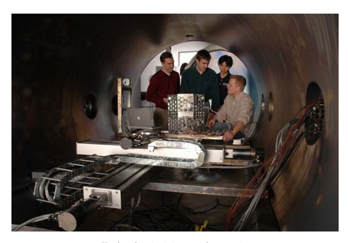
Hands on learning is important for any major