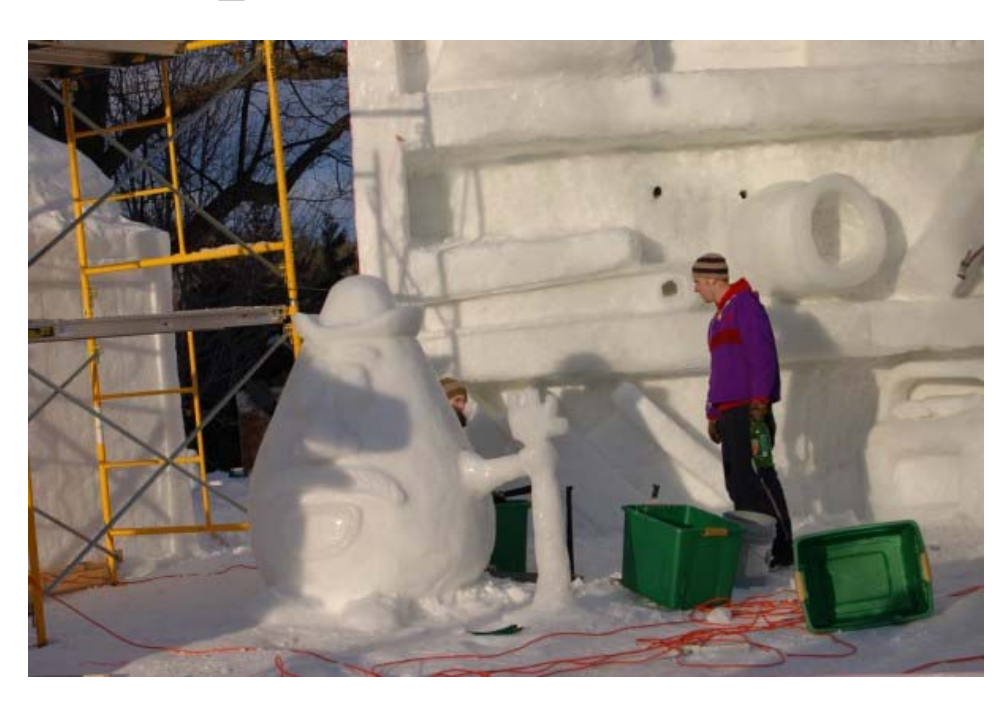
Even in winter, students keep their spirits high with Winter Carnival