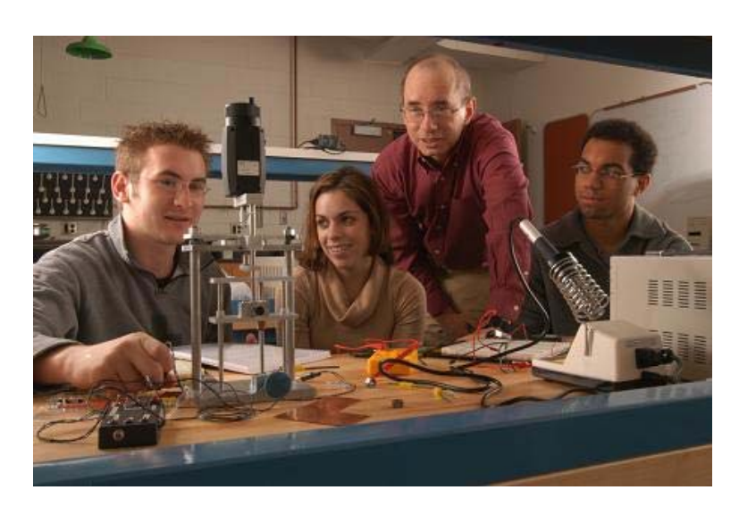
Electrical Engineering Lab