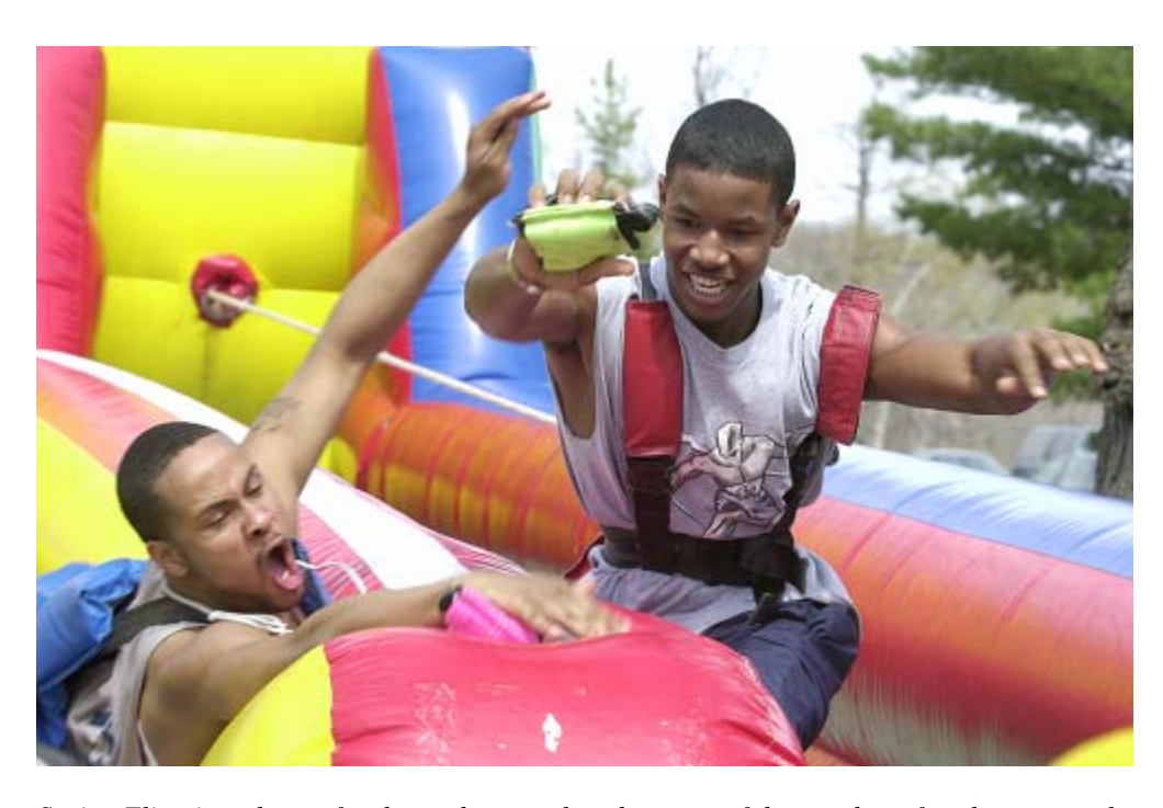
Spring Fling is a chance for the student to take advantage of the weather after the snow melts