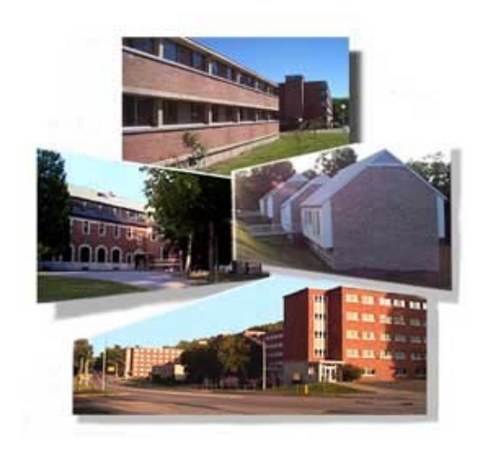
Student resident halls and apartments