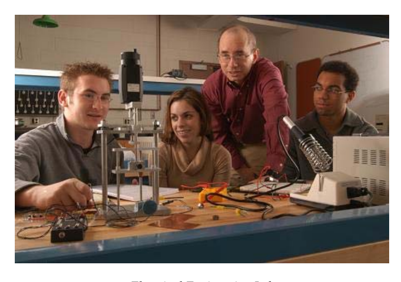
Electrical Engineering Lab