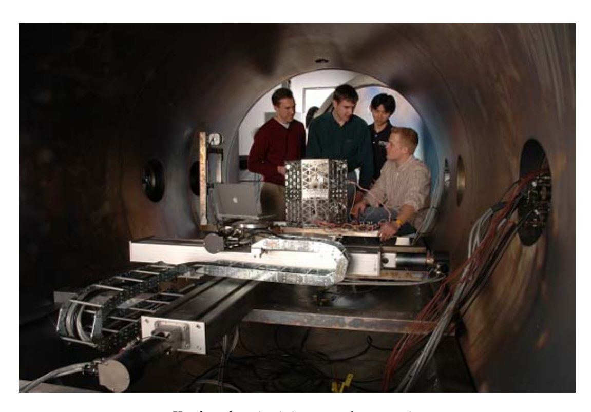
Hands on learning is important for any major