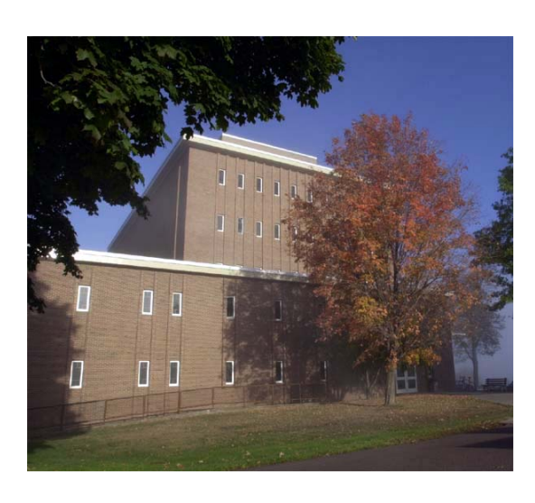
The Administration Building