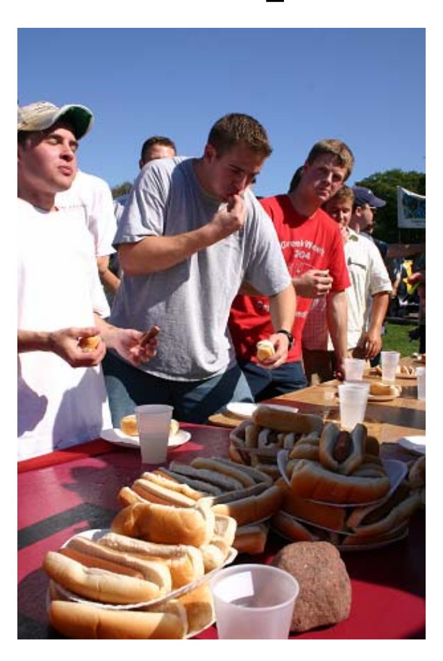
K-Day is an annual MTU Tradition