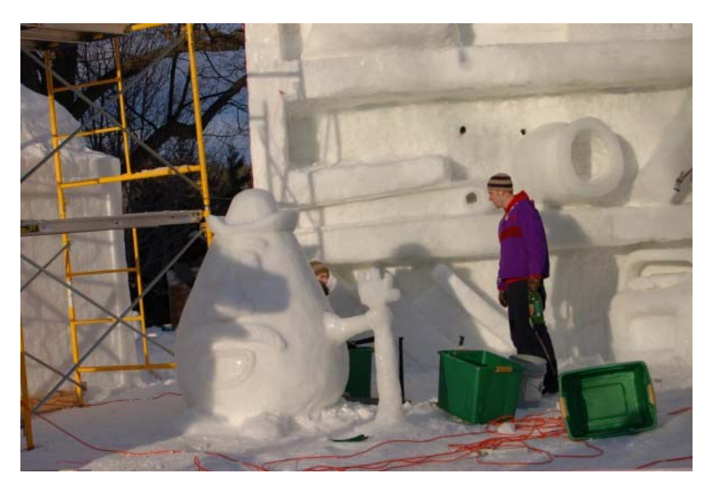
Even in winter, students keep their spirits high with Winter Carnival