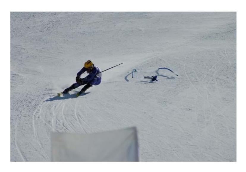
Students participate in many sports, even Alpine ski racing