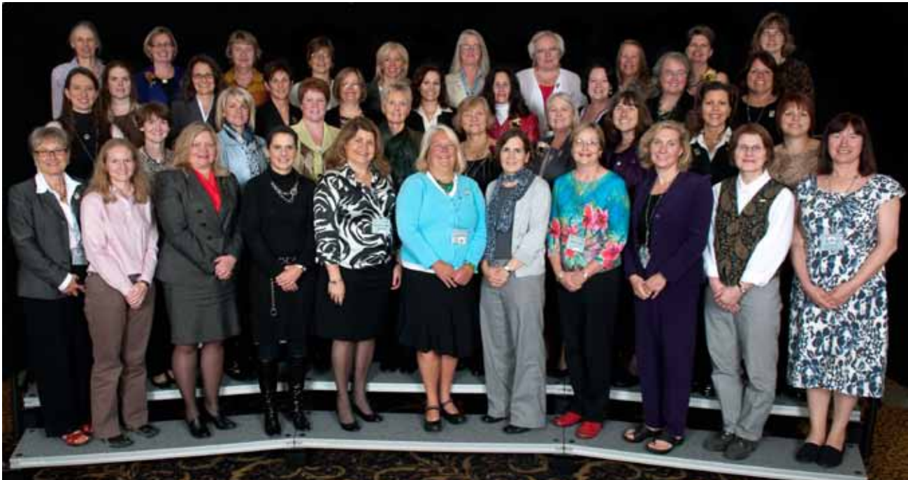
2011 PCA Annual Business Meeting

Seven members are entrepreneurs/business owners.