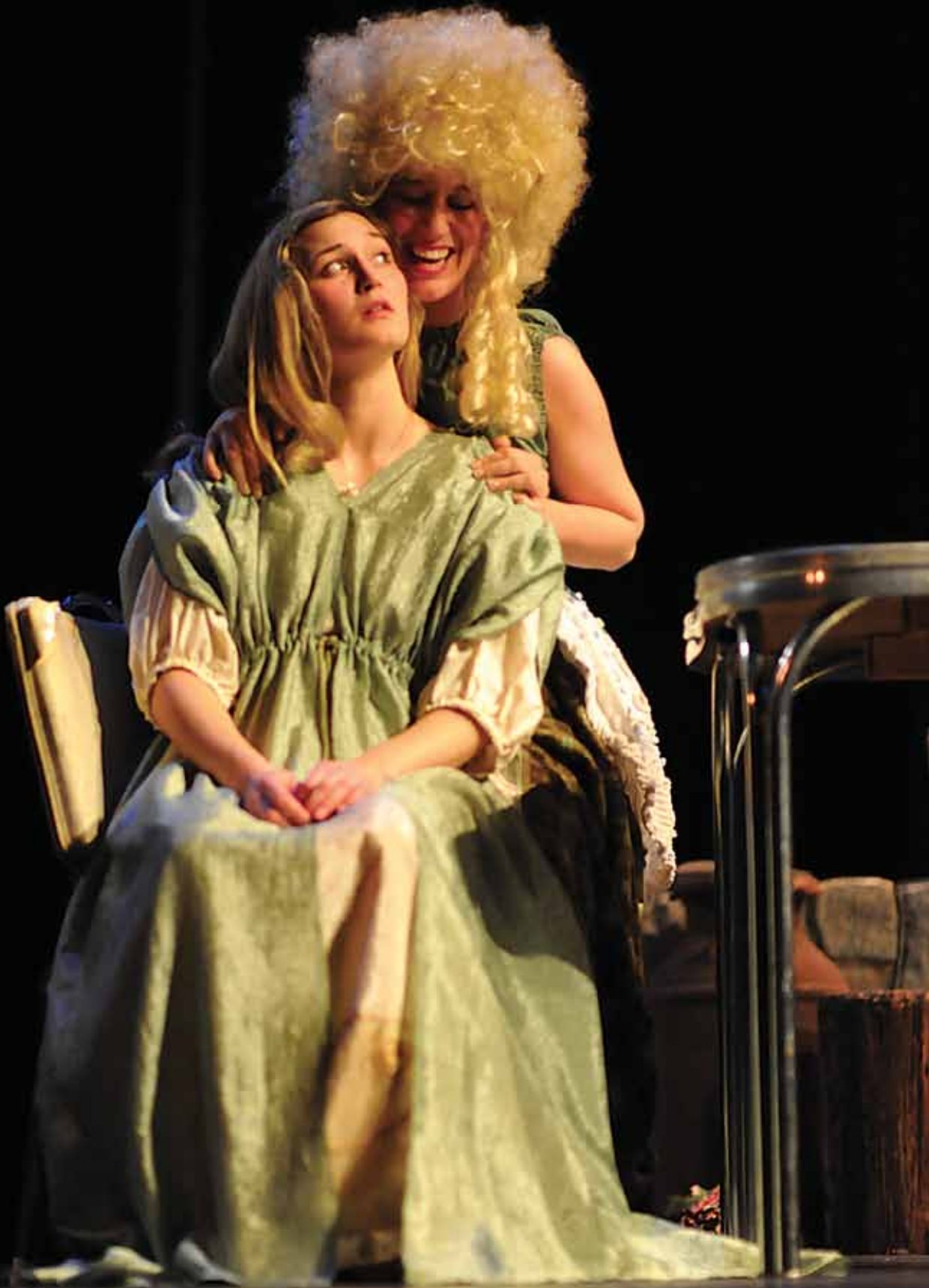
Musical: The Robber Bridegroom The play-within-a-play was performed with found objects from a trash heap for scenery, props, and costumes.