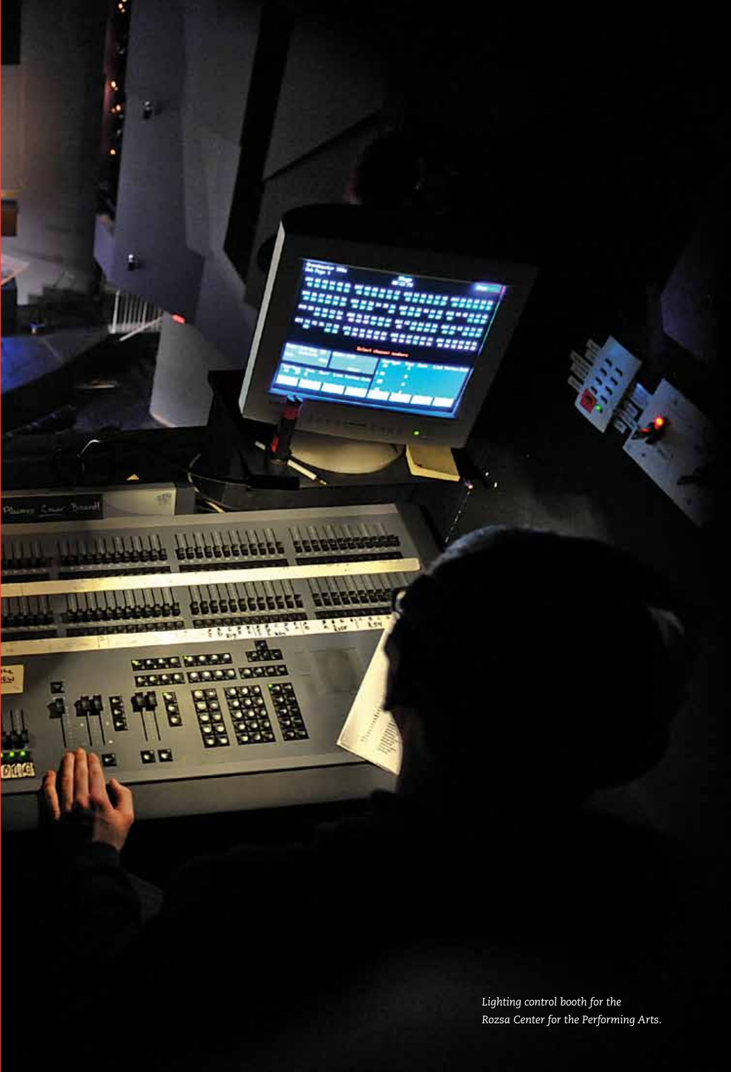
Lighting control booth for the Rozsa Center for the Performing Arts.