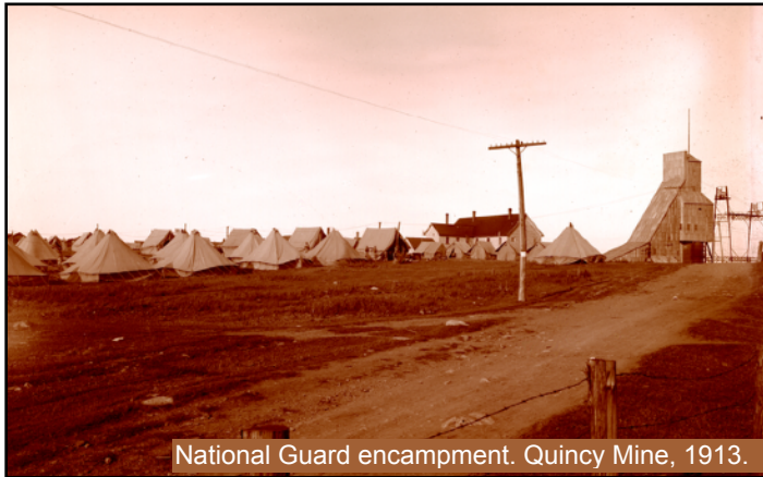
National Guard encampment, Quincy Mine, 1913.