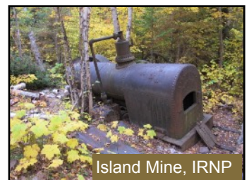
Island Mine, IRNP