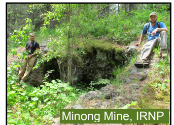
Minong Mine, IRNP

Field schools are essential ways for students to learn a wide range of basic techniques and skills common to archaeological fieldwork: mapping, survey, excavation, note taking, drawing, photography, artifact care, and cataloging.