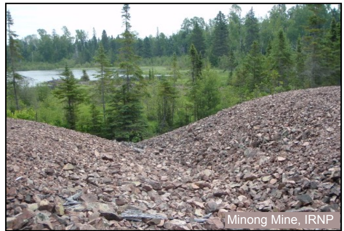
Minong Mine, IRNP