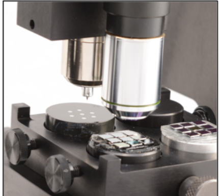
FIG. 1. The iNano mechanical testing system.

outcome is that the iNano offers unparalleled ability to perform high-speed testing and unmatched ability to capture sudden events such as strain bursts, fracture, film delamination, and dynamic ringing. A sampling of iNano's unique testing capabilities are: