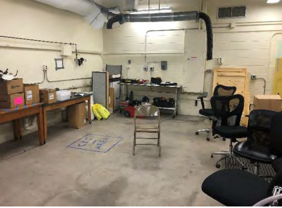
Overview: A project space currently utilized by Consumer Product Manufacturing. This space is 721 square feet