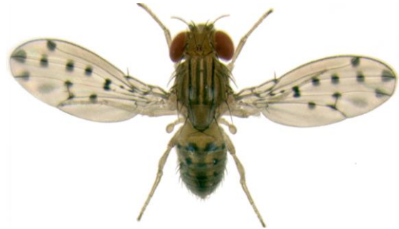
Figure 1: Intricate spot patterns are displayed on Drosophila guttifer 's wings, thorax, and abdomen.

Background: There is an incredible morphological diversity in the animal kingdom. However, despite the number of differing morphological traits between animals, they all share a small set of highly conserved toolkit genes (developmental genes) that build their basic body plans [1, 2]. After development, some of these genes initiate the formation of other novel traits such as color patterns. Fruit flies are ideal candidates for studying these developmental genes because of their short lifespans, ease of genetic manipulation, and they exhibit complex color patterns on their wings and abdomen. Our lab chose Drosophila guttifer to study these toolkit genes because of the vivid, unmistakable color patterns that exist on the wings, the thorax, and the abdomen (Fig. 1). Furthermore, the genetic networks underlying pathways for fruit fly color patterns are similar to cancer and disease-causing pathways in humans [3].